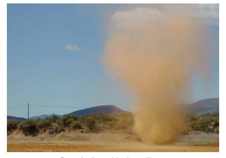
Dust devil on old mine tailings.