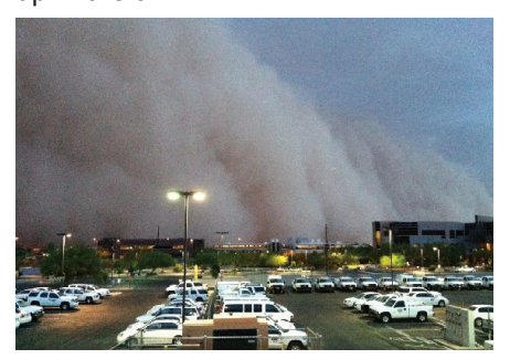
Haboob dust storm in Phoenix, Arizona.

Smaller dust events can also be very intense. Localized high winds blowing continuously over a dust source cause "corridors" or "plumes" of dust. This kind of dust storm can be too small to identify from weather stations or satellites and can lower visibility down to just meters. Small dust events can also strike with little warning and last up to an hour or more. Dust devils are another form of a local, hard-to-detect but intense dust event that whirls dust up in the air.